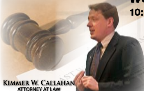
KIMMER W. CALLAHAN ATTORNEY AT LAW

Make your reservation at no cost and no obligation. Or call to schedule your free consultation.