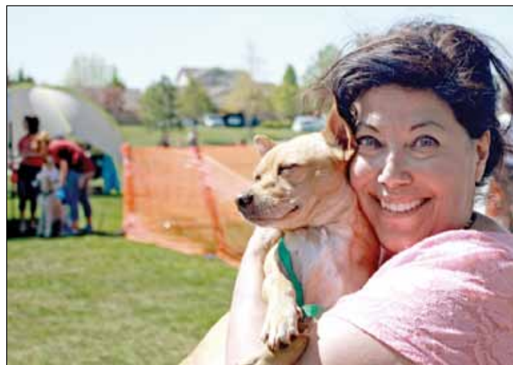
SPLASH AND SUBMITTED PHOTOS